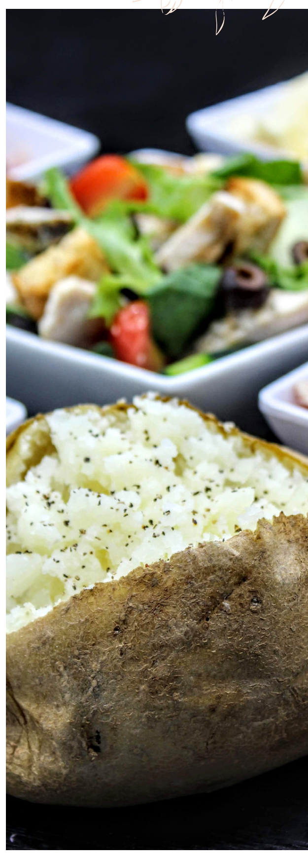
Baked Potato Bar

Many of our products contain or may come into contact with common allergens including wheat, peanuts, soy, tree nuts, milk, eggs, fish and shellfish. Before placing your order, inform the person taking the order if a person in your party has a food allergy so that we can, at your request, provide you with a list of ingredients