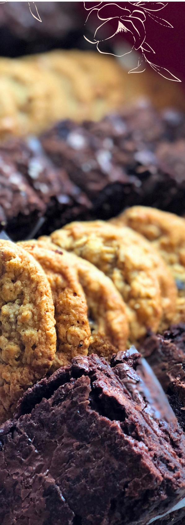
Assorted Cookie & Brownie Tray

A farm fresh tray filled with crispy garden vegetables attractively arranged and served with a cool ranch dipping sauce.