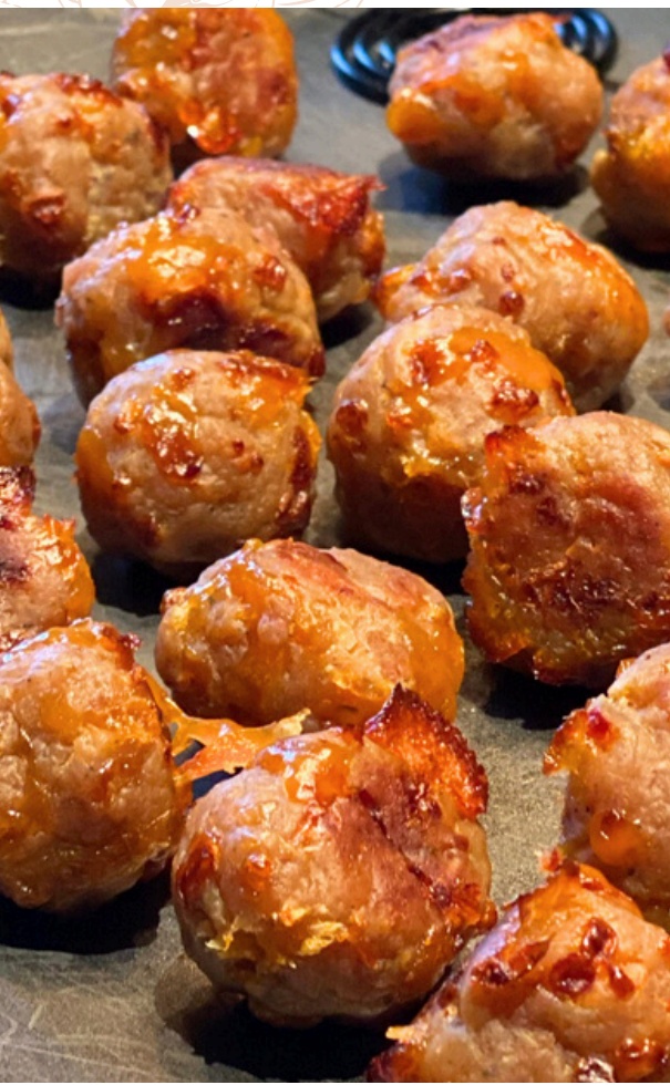
Sausage Cheddar Balls

Many of our products contain or may come into contact with common allergens including wheat, peanuts, soy, tree nuts, milk, eggs, fish and shellfish. Before placing your order, inform the person taking the order if a person in your party has a food allergy so that we can, at your request, provide you with a list of ingredients