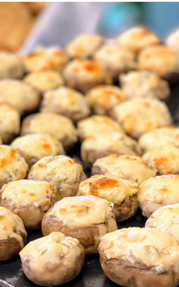
Cheese Stuffed Mushrooms