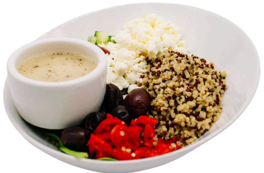
Mediterranean Power Bowl

Many of our products contain or may come into contact with common allergens including wheat, peanuts, soy, tree nuts, milk, eggs, fish and shellfish. Before placing your order, inform the person taking the order if a person in your party has a food allergy so that we can, at your request, provide you with a list of ingredients