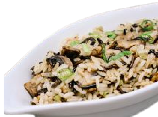
Vegetable Rice Pilaf

Fluffy rice seasoned with diced onions, tomatoes, and a blend of Mexican spices